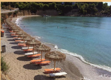
AKS Porto Heli Beach

The Conference venue is at AKS Conference Center, located within the campus of AKS Porto Heli Hotel. The Hotel is on the waterfront of Porto Heli village, east coast of Peloponnese, Greece . It boasts some of the most beautiful beaches in Greece, lively summer nightlife and a wealth of tourist facilities. Near by Porto Heli village lay many important archeological sites such as the ancient theatre of Epidaurus and the prehistoric city of Mycenae, as well as the popular tourism islands of Hydra and Spetses. The participants will be able to visit these sites during the conference mobile workshop and the post conference one-day cruise. Details are provided on the Conference Website.