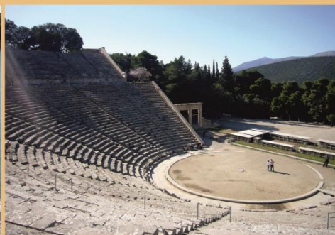
Ancient Theatre of Epidaurus