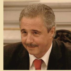
Prof. Yannis Maniatis University of Pireaus, Minister of the Greek Ministry of Environment, Energy and Climate Change